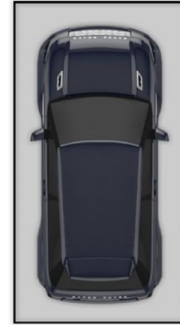
Carport (not in position)

THIS FLOOR PLAN IS A SKETCH ALL DATA SHOWN IS GENERAL ONLY NO ALL DIMENSIONS STATED ARE APPROXIMATE ONLY AND SHOULD NOT BE TAKEN AS DEFINITE.