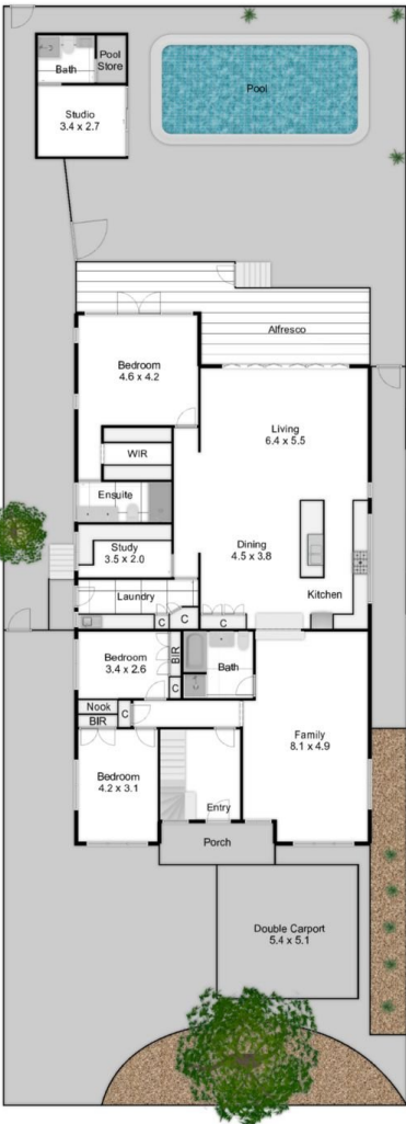
Ground Floor/Site Plan